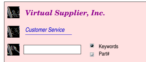
Figure 2: Rearranged Page

<TABLE> <TR> <TD><IMG SRC="supplier.gif"></TD> <TD><H1>Virtual Supplier, Inc. </H1> </TD> </TR> <TR> <TD><IMG SRC="cust.gif"></TD> <TD><A HREF="cust.html"> Customer Service </A><BR></TD> </TR> <FORM METHOD="POST" ACTION="search.cgi"> <TR> <TD><INPUT TYPE="image" SRC="search.gif"> </TD> <TD><INPUT TYPE="text" SIZE="15" NAME="VALUE"> </TD> <TD> <INPUT TYPE="radio" NAME="ATTR" VALUE="1" checked> Keywords<BR> <INPUT TYPE="radio" NAME="ATTR" VALUE="2"> Manufacturer Part# </TD> </TR> </FORM> </TABLE>